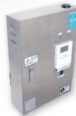
Switch box for changing operation